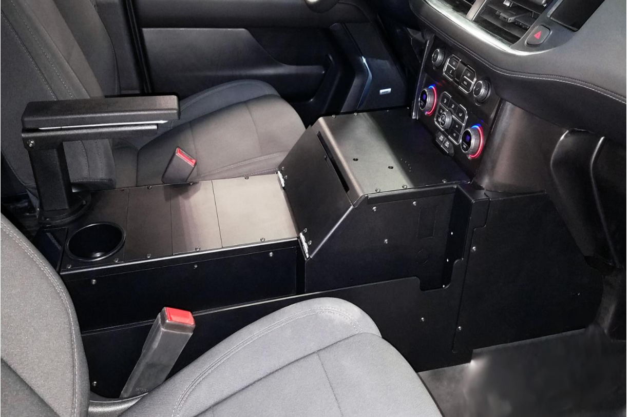
Full width Tahoe 2021-2024 console shown with optional blank faceplates, break-away armrest, cup holder and in-console printer